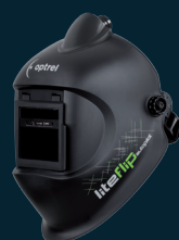
liteflip autopilot Réf. 4441.700