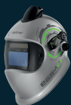
e684 Réf. 4441.600

The optrel e3000 PAPR system can be used in combination with the following PAPR and grinding helmets: