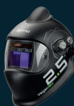
vegaview2.5 Réf. 4441.800