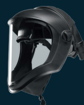
g300 Réf. 4900.000